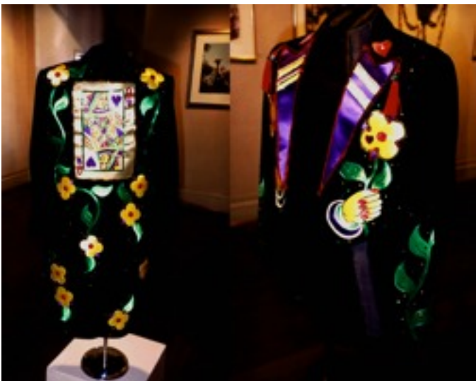
INVITATIONAL/MARDI GRAS EXHIBIT 1994 ACADEMY GALLERY, NEW ORLEANS