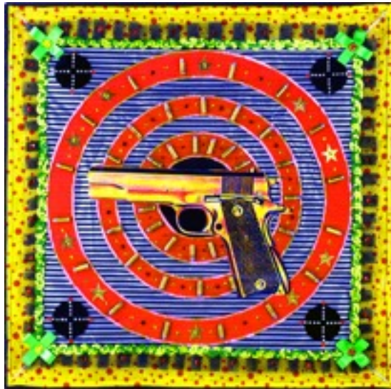
URBAN-MAN/30X31"/MIXED MEDIA 1997