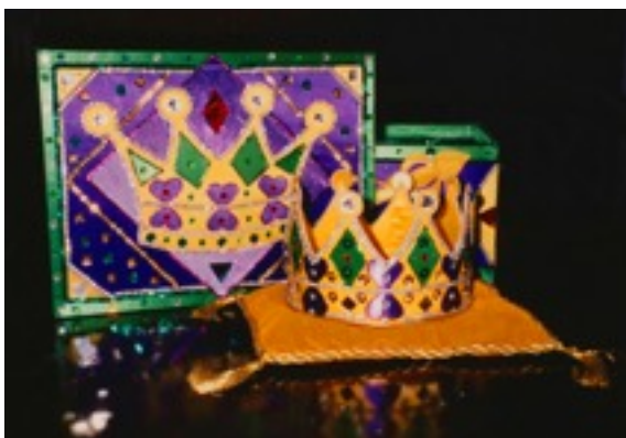
COMMISSION OBJECT/12X16X13" MIXED MEDIA 1994