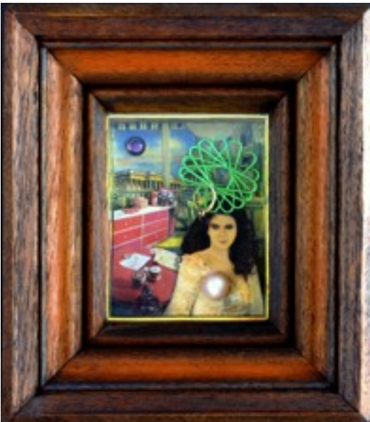
BRIDE IN A BOX/1998/4X6" MIXED MEDIA