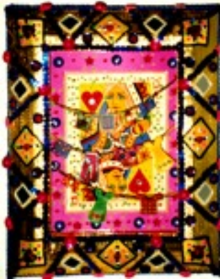
OBJECT/1993/2X3" MIXED MEDIA