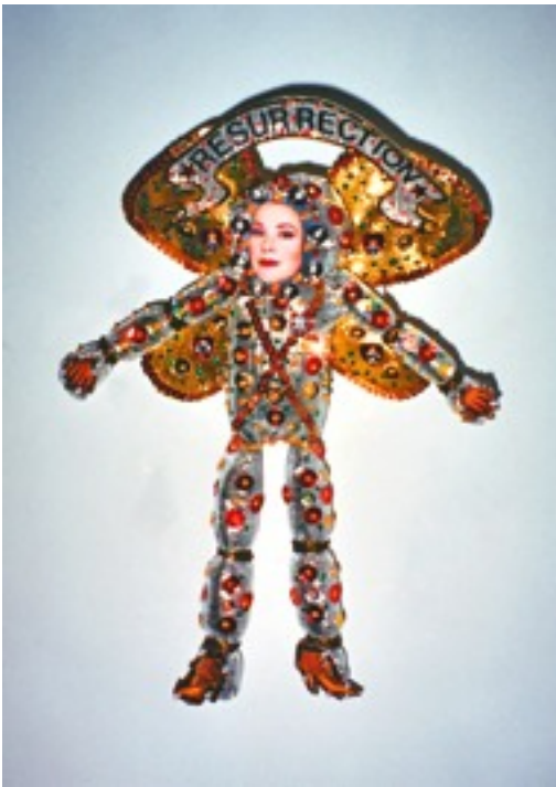
RESURRECTION ANGEL/MIXED MEDIA 5X4.5"/ 1992

DONATION/AIDS XMAS AUCTION/1992 CONTEMPORARY ARTS CENTER