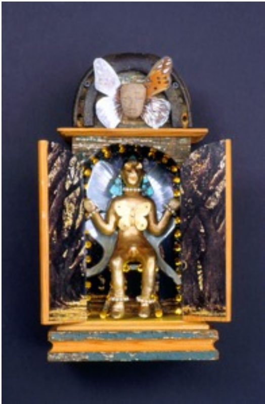
OBJECT/8"X11"X5" OPEN 1995