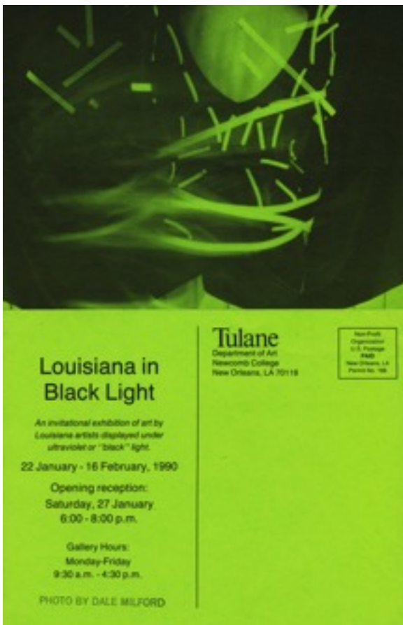
LOUISIANA IN BLACK LIGHT 1990 INVITATIONAL TULANE UNIVERSITY/NECOMB COLLEGE GALLERY