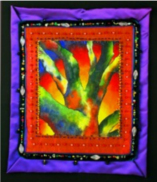
TREE TAPESTRY/1998/10X14"/MIXED MEDIA