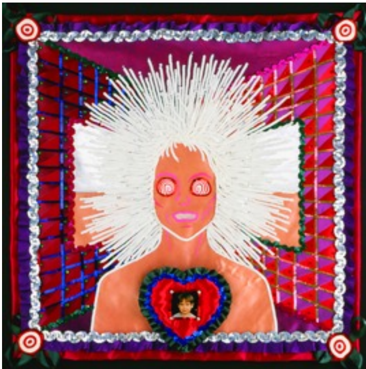
MOTHER-HOOD/1994 26X26"/MIXED MEDIA