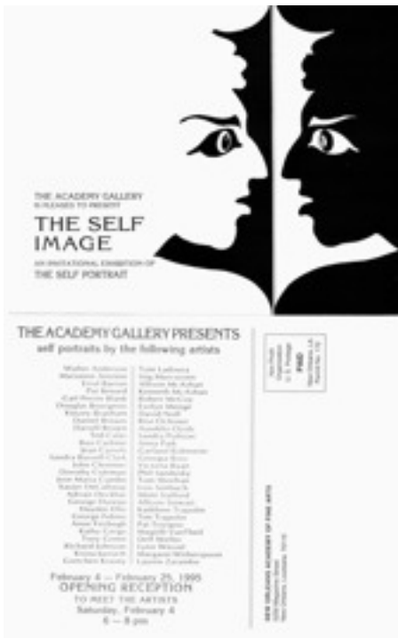
EXHIBITION 1995 THE SELF IMAGE ACADEMY GALLERY NOLA.