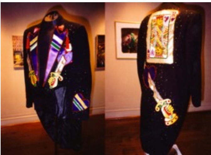
COMMISSION/KING/1994 MIXED MEDIA